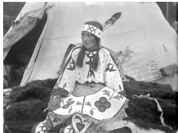
Blue Bird, Nakoda girl

They used to inhabit large parts of British Columbia, Alberta, Saskatchewan, and Montana, [1] but their re-