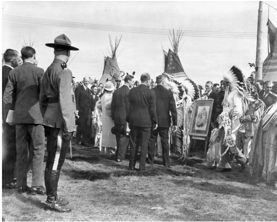
King George VI and Queen Elizabeth greet chieftains of the Stoney Indian Tribe, who have brought a photo of Queen Victoria, during the Royal Visit to Canada in 1939. The Treaties were originally signed by representatives of the British Crown acting in Queen Victoria's name.

The Nakoda (also known as Stoney or Îyârhe Nakoda )